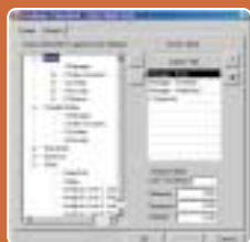
Configure Timesheet Set up the headings for your timesheet