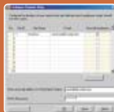
Configure Remote Sites Set up the location of each of your remote sites